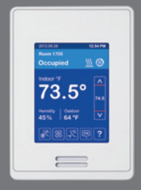
Blue touch screen with English language