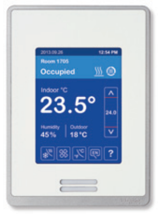
As shown: silver cover, white fascia, and blue touch screen

All these features are offered with the sole purpose of lowering installation costs, minimizing downtime, and accelerating the return on investment for building owners and facility managers.