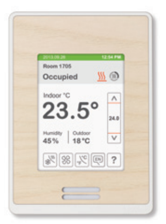
As shown: white cover, light tan wood fascia, and white touch screen

Introduce a natural ambiance to any decor by bringing outdoor elements into your space. Our selection of light tan, dark brown, and black wood finish fascias offer stylish options combined with the warmth of wood. By mixing the fascia color palettes with our customizable screen color schemes, you can achieve the perfect variation to create your own personal statement.