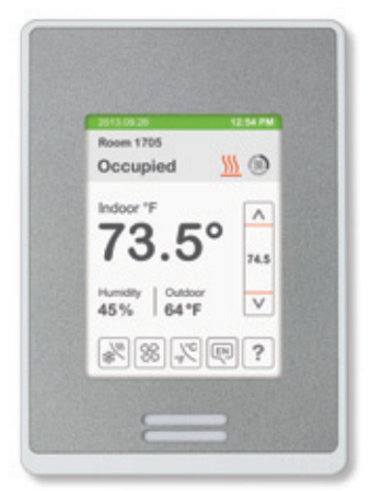
As shown: white cover, silver fascia, and white touch screen