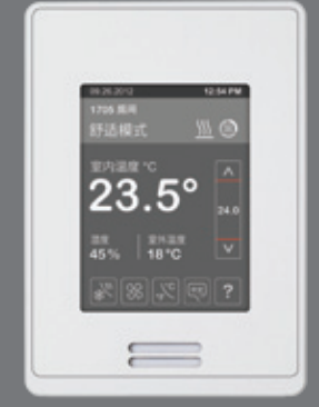
Dark grey touch screen with Chinese language