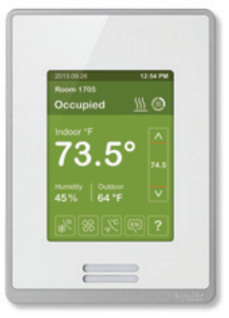
As shown: silver cover, glossy translucent white fascia, and green touch screen