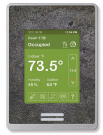
As shown: silver cover, light grey slate fascia, and green touch screen