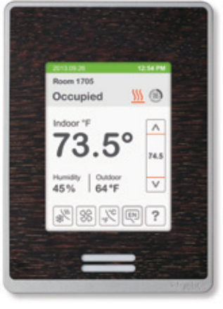
As shown: silver cover, dark brown wood fascia, and white touch screen