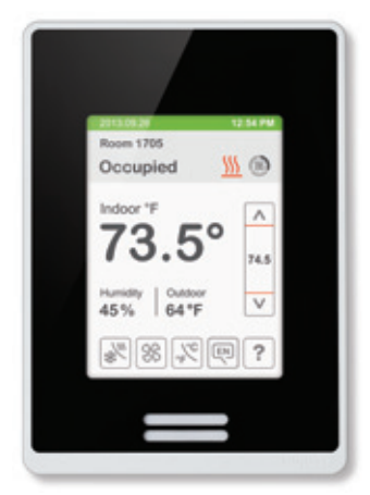
As shown: white cover, glossy translucent black fascia, and white touch screen

Save your space from monotony with our stylish room controller, adorned with a bold and glossy finish. Whether you are introducing a luxurious theme or are attracted by more eclectic decor, you will be creatively inspired by the ability to accentuate modern furnishings and styles. Our selection of bold finishes and textures will visually entice and impress your guests.