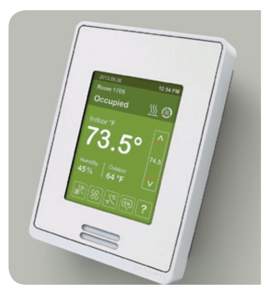
As shown: white cover, white fascia, and green touch screen

Less downtime means minimal disruption to operations, less unoccupied rooms for hotels, and uninterrupted class schedules for educational facilities.