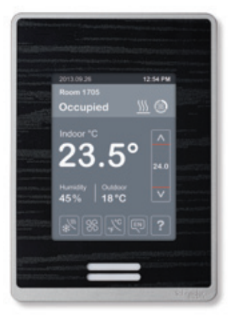
As shown: silver cover, dark black wood fascia, and grey touch screen