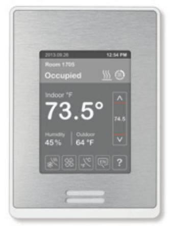
As shown: white cover, brushed aluminum fascia, and dark grey touch screen

By combining our extensive palette of colors, textures, and finishes, your personal style and creativity options are unlimited.