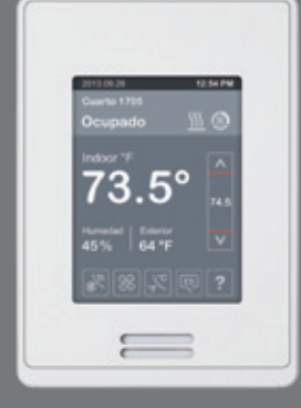
Grey touch screen with Spanish language