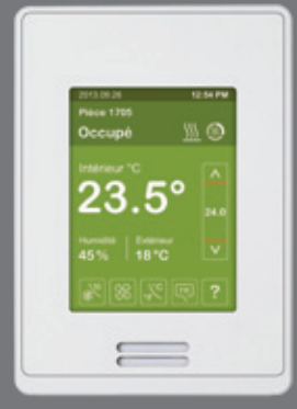
Green touch screen with French language