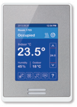
As shown: white cover, glossy translucent silver fascia, and blue touch screen